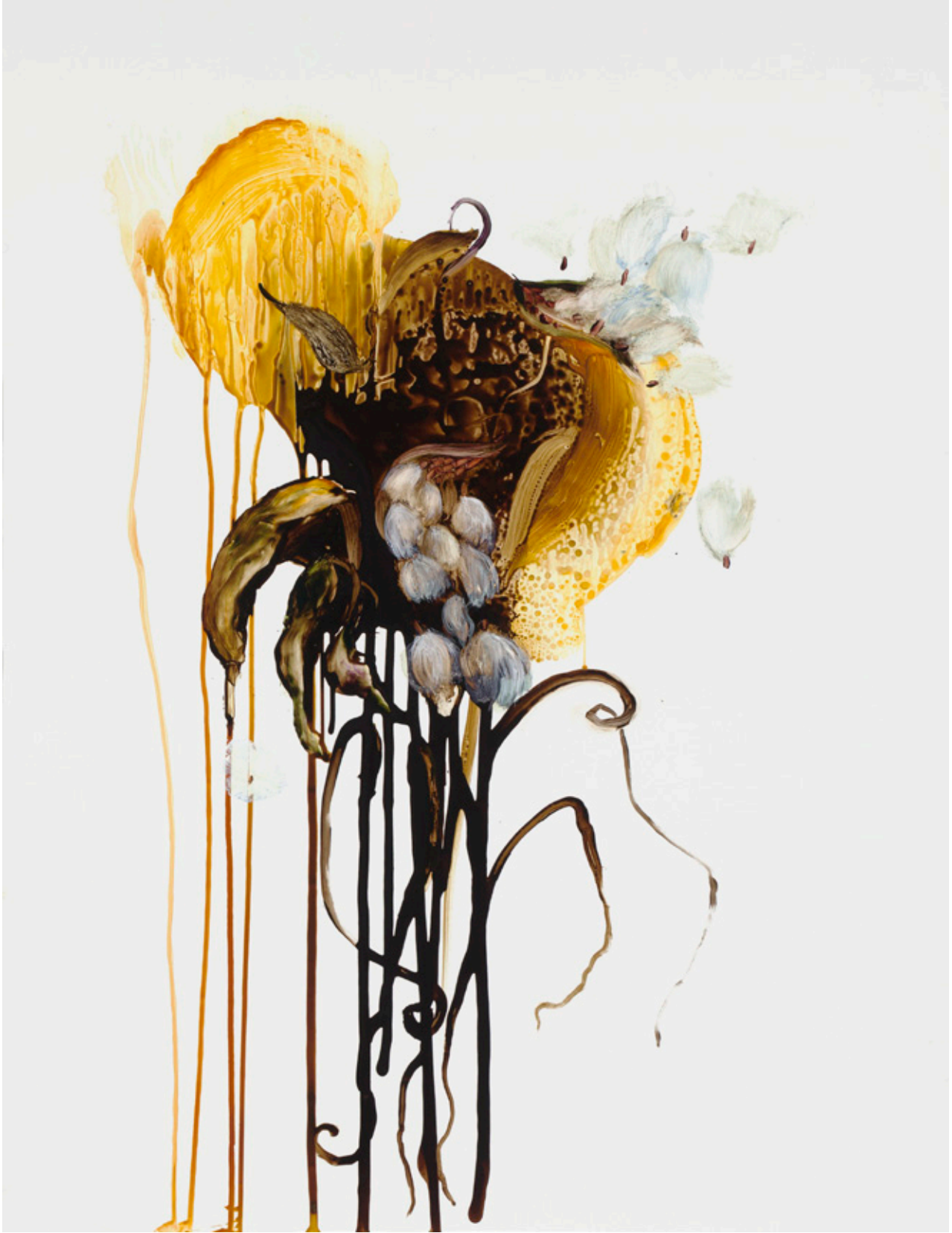
22 Fall Purse