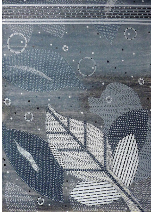
Glenn Goldberg, "Other Place 22" (2013), acrylic, gesso, and ink on canvas, 16 x 12 in / 40.6 x 30.5 cm

JS: How would you describe the process of coming into work that was your own?